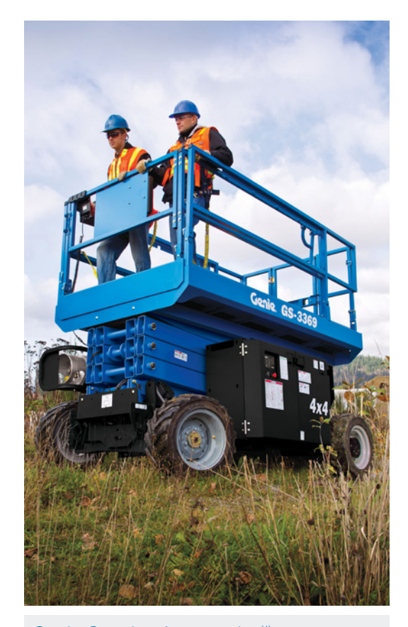
Swing-Out Engine Tray