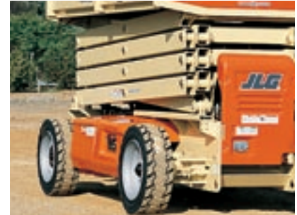
Optional All-Wheel Drive Provides Superior Performance On or Off Slab

*Certain options or country standards will increase weight.